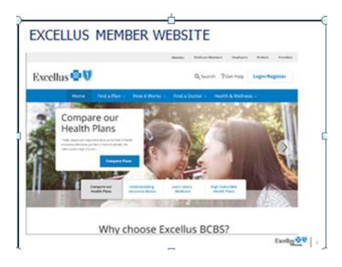
Step 1. Go to excellusbcbs.com